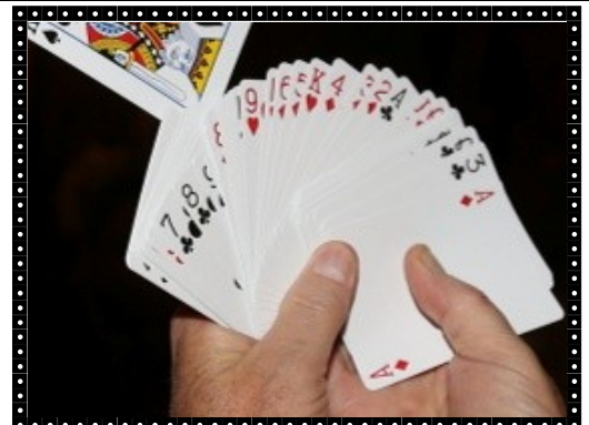
Too many cards to even see the Joker.