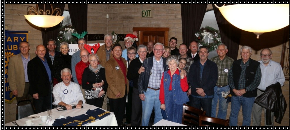
Donors to the “Grand Fine Day.”